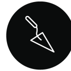
Damp Proof Course