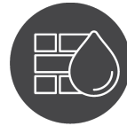
Damp Proof Membrane