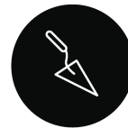
Damp Proof Course