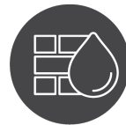
Damp Proof Membrane